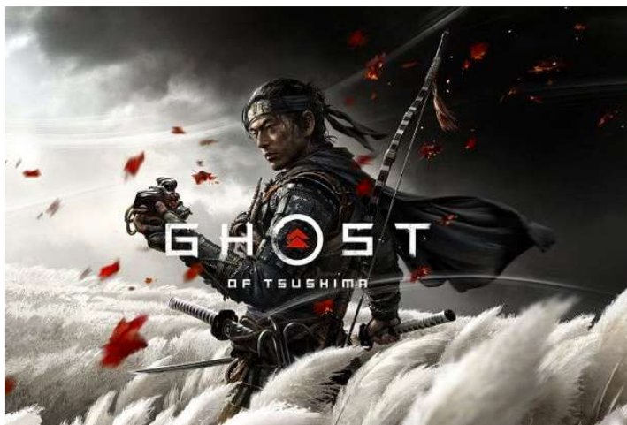
Cover art for Ghost of Tsushima.

The Houston Rockets traded James Harden to the Brooklyn Nets in return for Victor Oladipo, Dante Exum, and a ton of first round swaps and picks. This now leaves the Rockets without James Harden and Russell Westbrook, a brewing dynamic duo. The Nets now have Kyrie Irving, Kevin Durant, and James Harden, making them among the top favorites to win the NBA Finals this season.