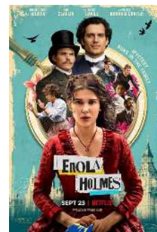
Official promotional poster for Enola Holmes (2020), licensed & distributed by Netflix

If you're looking for a good action comedy-mystery, allow me to recommend Enola Holmes . Enola Holmes features some very talented actors such as Millie Bobby Brown, Louis Partridge, Sam Claflin, Henry Cavill, and Helena Bonham Carter. The movie is about a young girl who goes on a quest to find her missing mother by deciphering the clues she left behind. At the same time, she desperately tries to avoid her brothers, Sherlock and Mycroft Holmes, who wish to send her to a boarding school for young ladies. The plot thickens when she must help an escapee lord, possibly jeopardizing her own plans. Besides being a funny, engaging movie, there are some surprise twists which make it a mystery. The roles were very well executed and the costumes accurately depicted the time period (London, 1884). I'd definitely recommend watching with your friends or family and personally really enjoyed it.