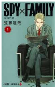
Spy x Family volume 1 cover (2019), illustrated by Tatsuya Endou and published in Shōnen Jump magazine

A hilarious and heartwarming series about a spy that is forced to adopt a child and fake a marriage in order to complete a mission...!