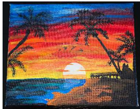
Sunset scenery by Noora Azceez