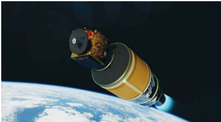
Al-Amal nearing the end of launch on the second stage of the H-IIA rocket.