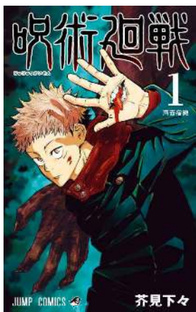
Jujutsu Kaisen volume 1 cover (2018), illustrated by Gege Akutami and published in Shueisha's Weekly Shōnen Jump magazine