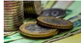
A photograph of notes and coins from the Reserve Bank of Zimbabwe.

Currency: Zimbabwe current currency is the RTGS dollar. One RTGS dollar only being worth 0.00276319 US dollars. Due to the inflation of the RTGS dollar, Zimbabwe also uses the US dollar for exchange.